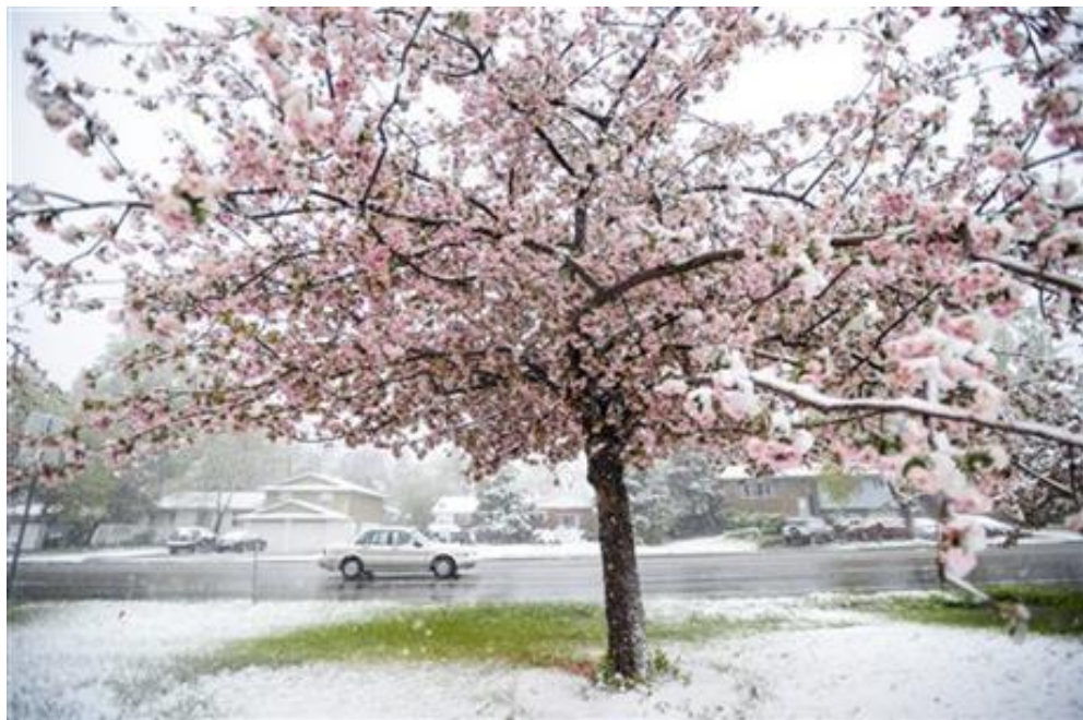
Figure 3: Snow falling on a blossoming tree in Fort Collins, CO on 11 May, 2014